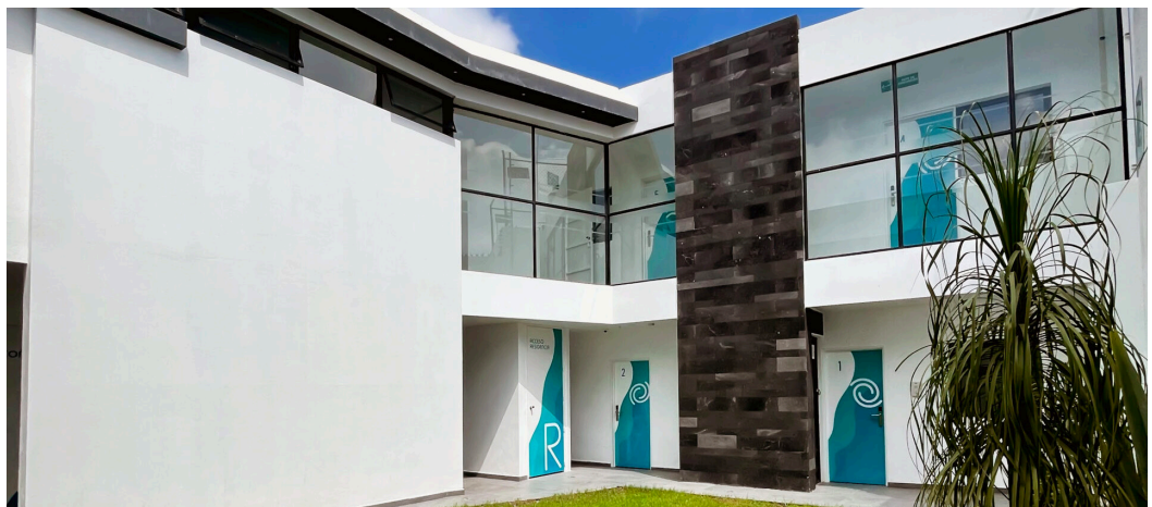
Bien Vita clinic.

This clinic focused on mental health provides two types of services: scheduled encounters, where professionals offer various types of psychotherapy, and on the other hand, stay programs for patients with care 24 hours a day, which include educational and expression workshops, group psychotherapies, and physical activities, among other services. During this residency service, the patient stays in controlled and monitored spaces by specialists responsible for proper nourishment and medication intake.